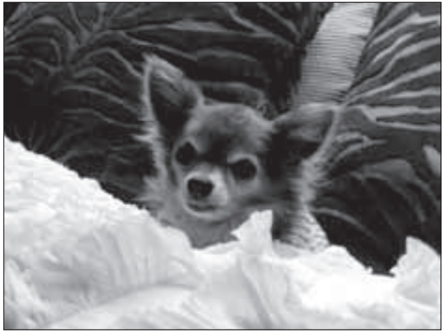
SQUIRT WAS MISSING A LARGE RECTANGLE OF HAIR ON HIS BACK. HIS HAIR IS GROWING BACK, AND HE HAS BEEN ADOPTED.

As always, money is needed to rescue these animals and to provide medical care. Donations can be mailed to: Chihuahua Rescue & Transport, P.O. Box 53115, Cincinnati, OH 45253. Or go to: <u>http://</u> <u>www.chihuahua-rescue.org</u>/ and click on "make a donation" in the left column.