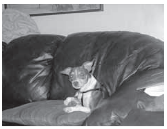
DUDLEY IS VERY SCARED AND IS BEING SOCIALIZED IN CHARLOTTE WHERE HE HAS LEARNED TO PLAY WITH HIS FOSTER BROTHER.