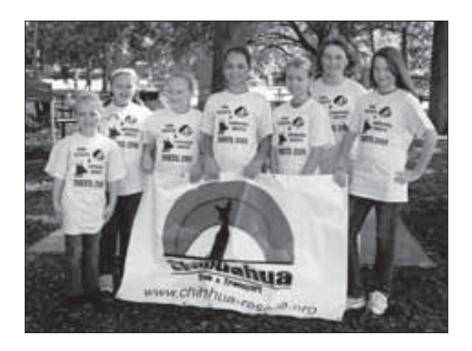
MEMBERS OF GIRL SCOUT TROOP 317 PREPARED GOODY BAGS AND GREETED VISITORS.

Our costume contest is always a huge hit. We had three categories: Best Dressed, Most Original and Best Group. We love watching the dogs dressed up and seeing the elaborate costumes everyone works