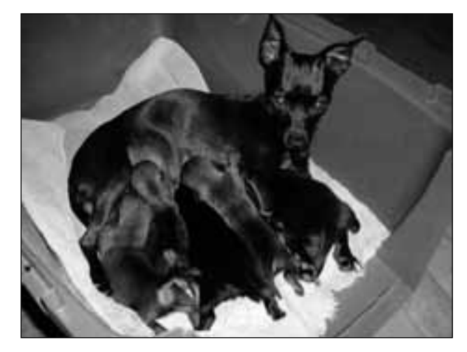
HANNAH WAS TAKEN FROM A HOARDER ALONG WITH 130 OTHER ANIMALS. SHE GAVE BIRTH IN A SHELTER IN FLORIDA.

We also have held several adoption fairs and manned a booth at the county fair, where we sold sheet sets with thread counts of 600 and 1,200, earning $5 to $7 per set sold. Our CRT group of volunteers sold more sheet sets than any other rescue group that participated, collecting more than $500 for one day. The owner of a local furniture store donated the booth and allowed